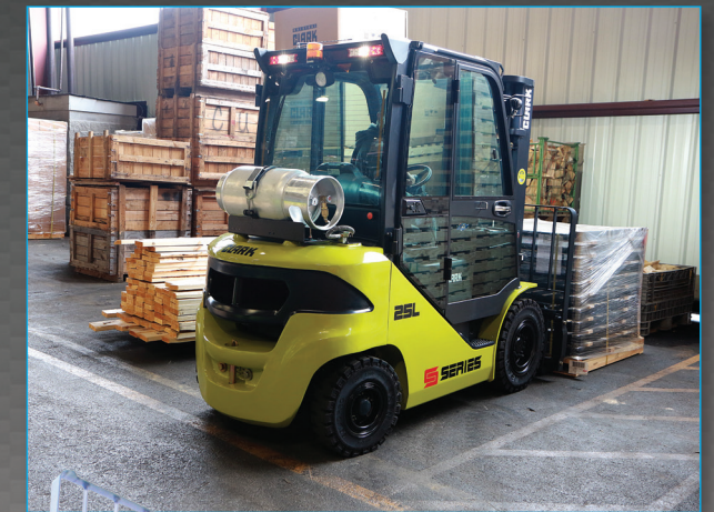
*Shown with optional cabin

Building on over 100 years of lift truck innovations, design and industry firsts. The evolution continues... the CLARK S-Series the next generation of lift trucks.